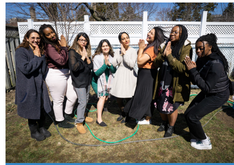
The Single sisters are spiritually ready for the battle!

If the harvest is not meant to be seasonal, why does it sometimes seem that it is? Why are some months more fruitful than others? Perhaps the following verse will help us to "open [our] eyes" and gain insight: "In the presence of God and of Christ Jesus, who will judge the living and the dead, and in view of His appearing and His Kingdom, I give you this charge: Preach the word; be prepared in season and out of season..." (II Timothy 4:1-2) This is not to say that preaching the word is seasonal, but that the Word of God should be preached regardless of whether or not it is accepted or not accepted, in season or out of season. We should always be prepared to preach!