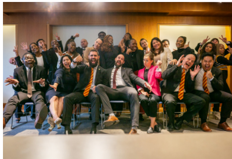
Our 2024 ICCM class is mostly serious... kinda!

The answer to this very important riddle is simple: It is not about the amounts; it is about the heart. Similarly to the widow’s offering just a few chapters later, where she gives up her entire savings account of two very small copper coins, (Luke 21:1-4) Jesus was never about the amount. The real contribution that He was concerned with was the unseen currency of a willing heart. Zacchaeus had a willing heart; and the rich ruler, despite his well-put-together religious persona, had an unwilling heart. He did not want to let go of his wealth.