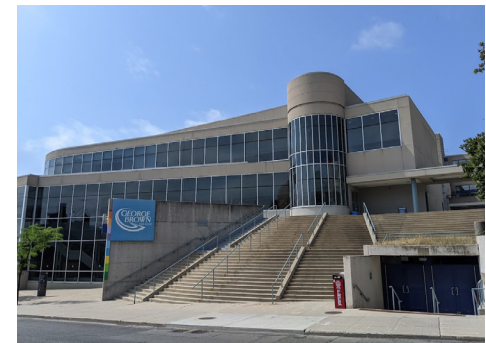
George Brown College, home to over 32,000 students is being planted today!

and obey [His] commands, then even if [our] exiled people are at the farthest horizon, [God] will gather them from there and bring them to the place [He has] chosen as a dwelling for [His] Name." (Nehemiah 1:8-9) In other words, if we do not obey God's commands He will scatter us like He did with those who were building the Tower of Babel. However, if we return to Him with all of our hearts, He will gather us. But gather us to do what? To scatter! Why? Because ultimately God wants His people to "...be fruitful and increase in number; multiply on the earth and increase upon it."