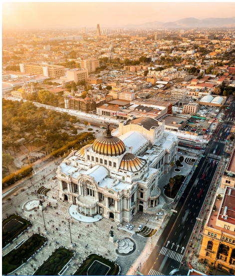
Mexico City is the beautiful location chosen for the 2023 ICLS and LAMC!

We are thrilled to have you all here in the vibrant and culturally rich Mexico City. As the heart of Mexico and one of the largest cities in the world, Mexico City has a history and cultural heritage that spans back thousands of years. From the ancient Aztec civilization to the Spanish colonial era, this city has been shaped by diverse influences, resulting in a unique blend of cultures and traditions and by God’s church. As we come together to celebrate our powerful God, we invite you to immerse yourself in the sights, sounds, and flavors of this incredible city.