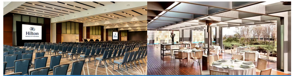
The ICLS and the LAMC will be hosted at the Hilton Mexico City Reforma! Please book your room soon!

TRANSPORTATION FROM THE AIRPORT: Due to the large number of disciples visiting, we are unable to pick everyone up at the airport. You will need to arrange your own transportation from the airport to the hotel. (Common rideshares are: Uber, DIDI and Cabify.)